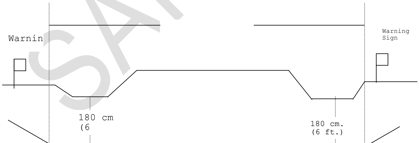
Facility Road Crossing